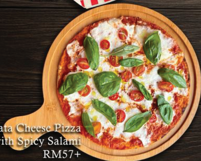
Burrata Cheese Pizza with Spicy Salami RM57+