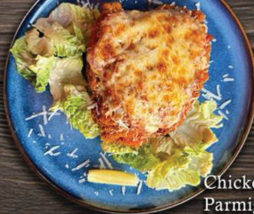
Chicken & Prosciutto Parmigiana RM43+