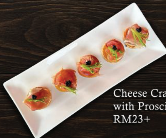
Cheese Cracker with Prosciutto RM23+