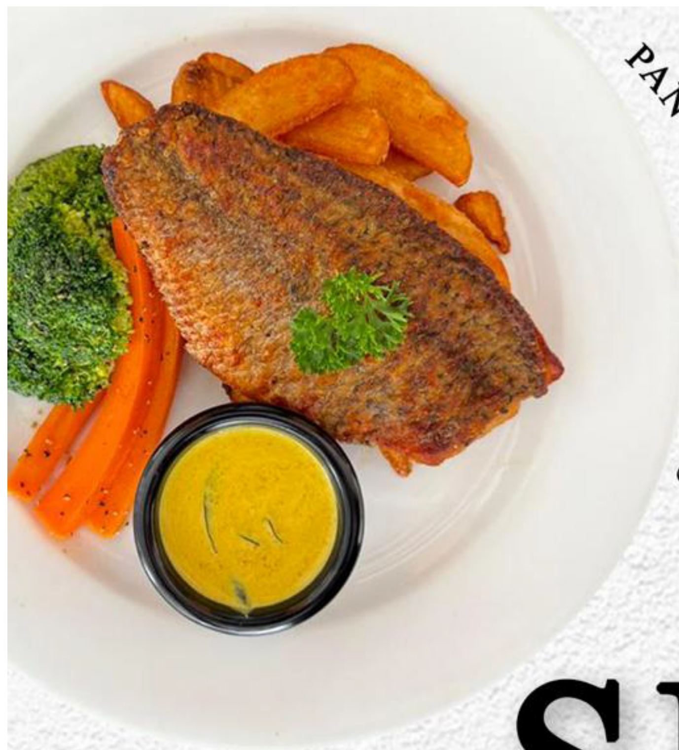
PAN SEARED SEABASS