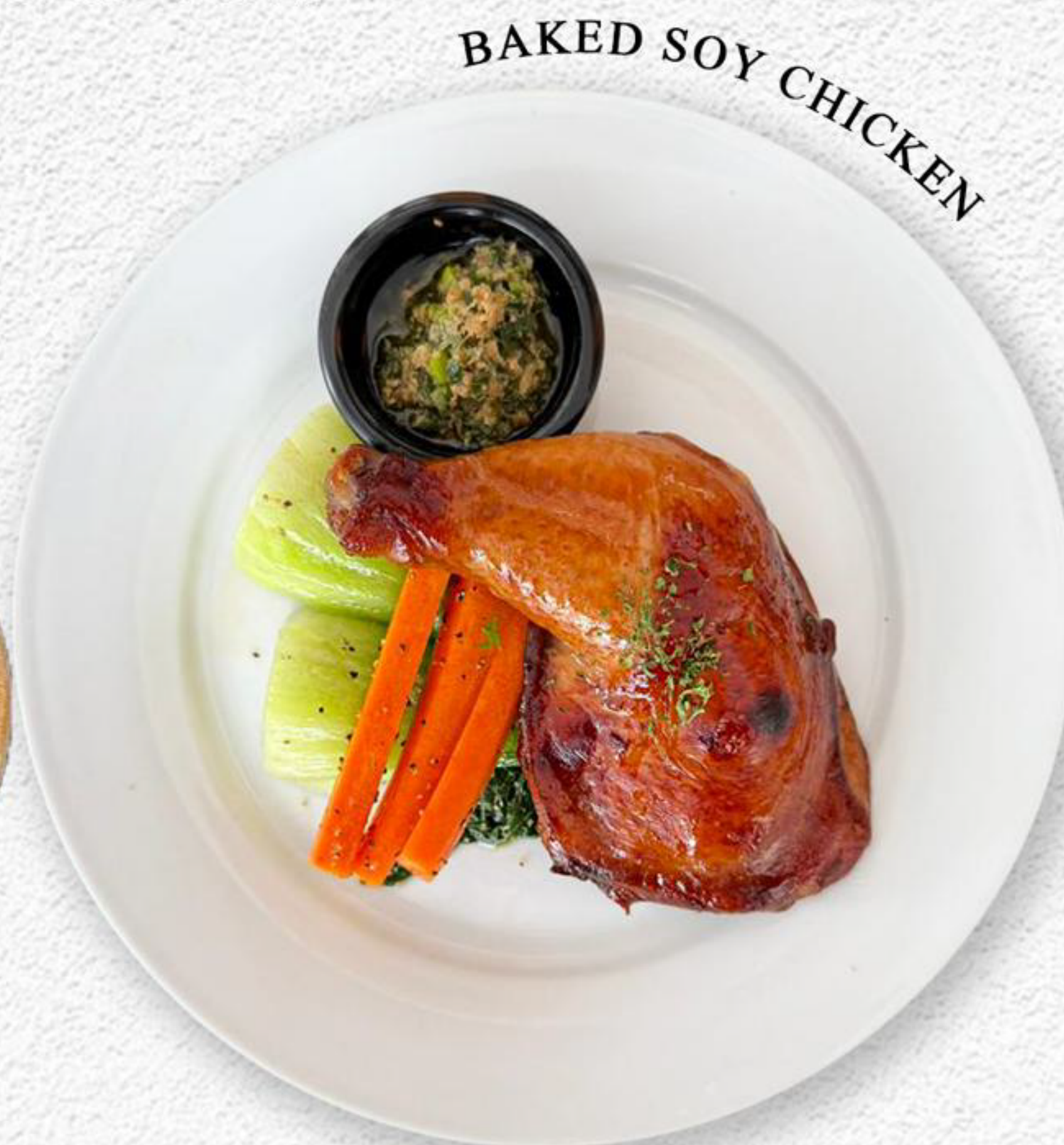
BAKED SOY CHICKEN