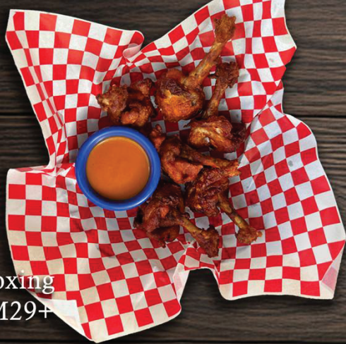
Chicken Boxing RM29+