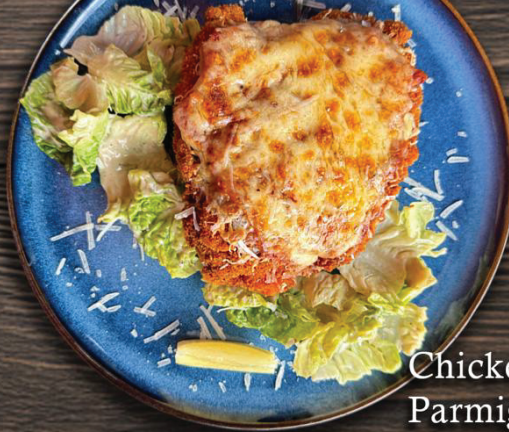
Chicken & Prosciutto Parmigiana RM43+