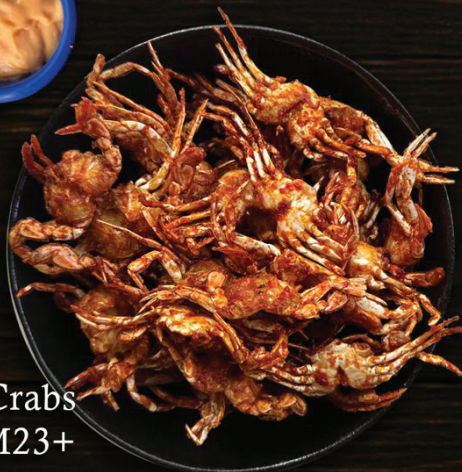
Crispy Baby Crabs RM23+