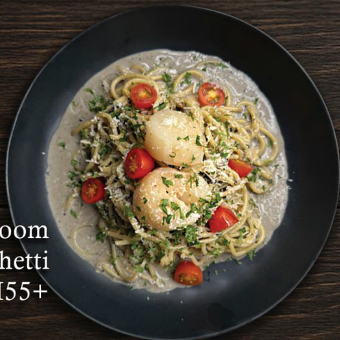
Scallop Mushroom Truffle Spaghetti RM55+