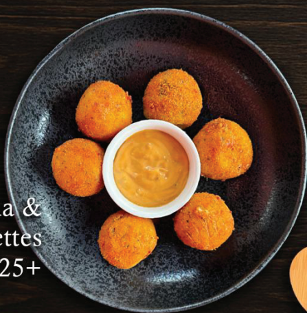
Tuna & Potato Croquettes RM25+