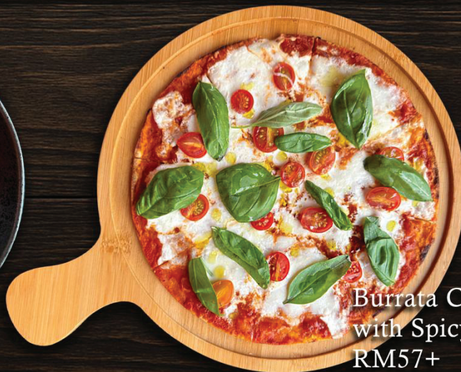
Burrata Cheese Pizza with Spicy Salami RM57+